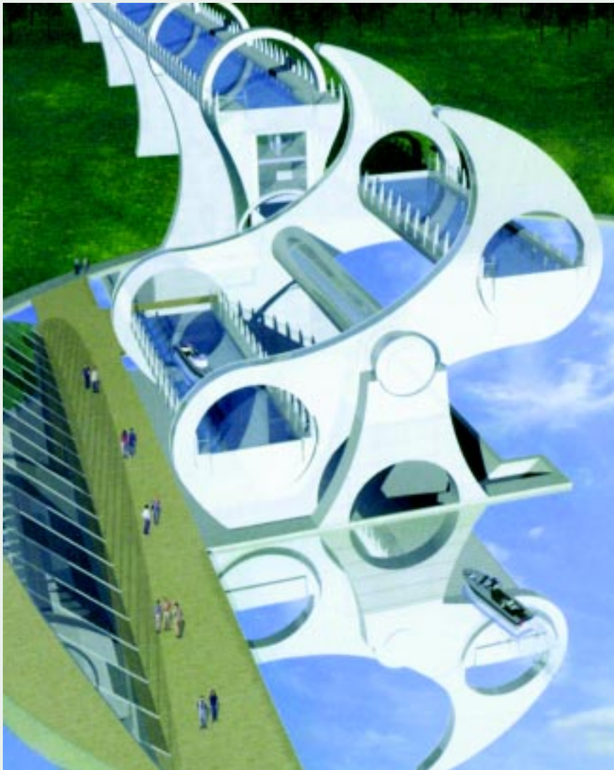
The Falkirk Wheel is a new giant rotating boat lift. It measures 35m in diameter, with an axle length of 28m, and will transfer boats between the two canals, over a vertical gap equivalent to the height of eight London buses.

Butterley Engineering, of Ripley, Derbyshire, England won the contract to build the wheel and its engineering design consultant, Bennett Associates, of